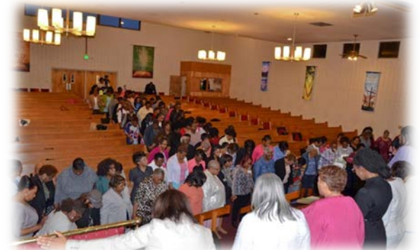
Women On A Mission